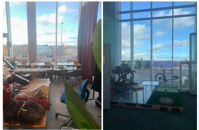
Indoor recycling area at Sydhavn recycling station

Sydhavn Recycling Center is located in Copenhagen SV and is the recycling center with the largest direct reuse area, which also aims to phase out "Small Combustibles" (Småt brændbart) (1). The site is designed so that citizens pass through a gateway where the reuse spotters are stationed. The spotters help citizens sort out items before they continue further into the site, so that, as far as possible, they avoid having to go around all the containers to retrieve items with reuse value. In the reuse area, there are both indoor and outdoor covered areas for storing the items delivered by citizens. Upholstered furniture and mattresses can therefore be stored indoors, preventing them from becoming damp. The reuse spotters experienced that the amount of waste had decreased after the introduction of the reuse area, indicating that the initiative appears to be working as intended.