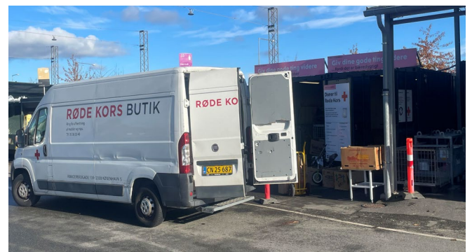
Røde Kors bil vehicle and container at Kirstinehøj Recycling Station.

Kirstinehøj recycling station is located in Kastrup and is the ARC recycling station that receives the most waste and the highest number of visitors (1). The recycling station has a direct reuse agreement with the Røde Kors. Røde kors has a permanently stationed container on-site. The container specifies that mattresses should not be deposited, but after conversation with an employee from Røde Kors at the site, it was revealed that citizens still place mattresses in the container. The employee mentioned that the mattresses are kept dry inside the container, but often, they are in a condition that cannot be resold. However, on occasion, they take some of the mattresses and sell them in their stores.